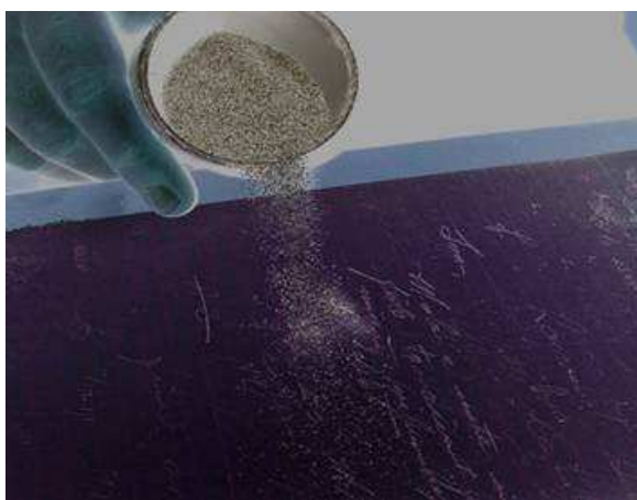
ESDA examination to develop latent writing impressions

Learn more about Forensic Document Services and Insight Risk Group at their websites: www.forensicdocument.com.au and www.insightriskgroup.com